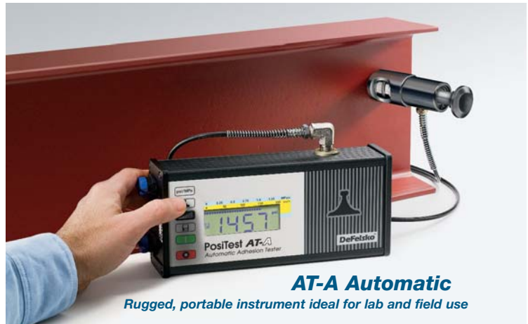
AT-A Automatic Rugged, portable instrument ideal for lab and field use