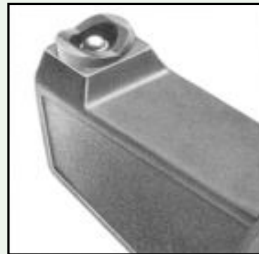
Carbide measuring probe for long life.

For: Hot dip galvanizing, hard chrome metalizing, paint, enamel, plastic coatings on steel