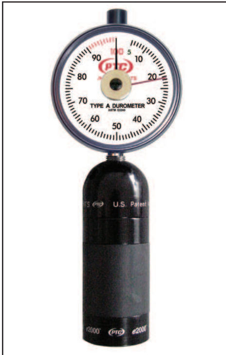
Model 501A e2000™ Series Analog ASTM Type A Durometer