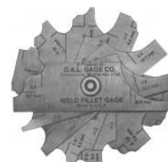
Weld Fillet Gauges

Combined set of gauges to measure concave or convex weld sizes for 3mm to 25mm.