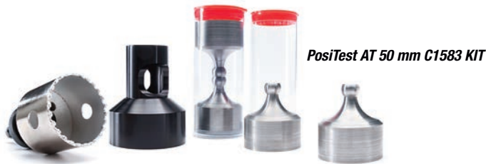
PosiTest AT 50 mm C1583 KIT

Convert your adhesion tester to a different model with our choice of Conversion Kits. Choose from 20 mm, 50 mm, 50 x 50 mm Tile and 50 mm C1583 kits. Kits include the appropriate stand-off, holesaw (if applicable) and test dollies.