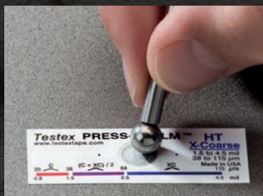
For use with Testex™ Press-O-Film™ Replica Tape

Measures and records surface profile parameters using replica tape